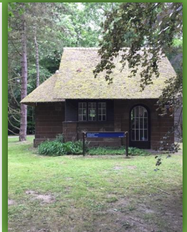
IAAS World Headquarters